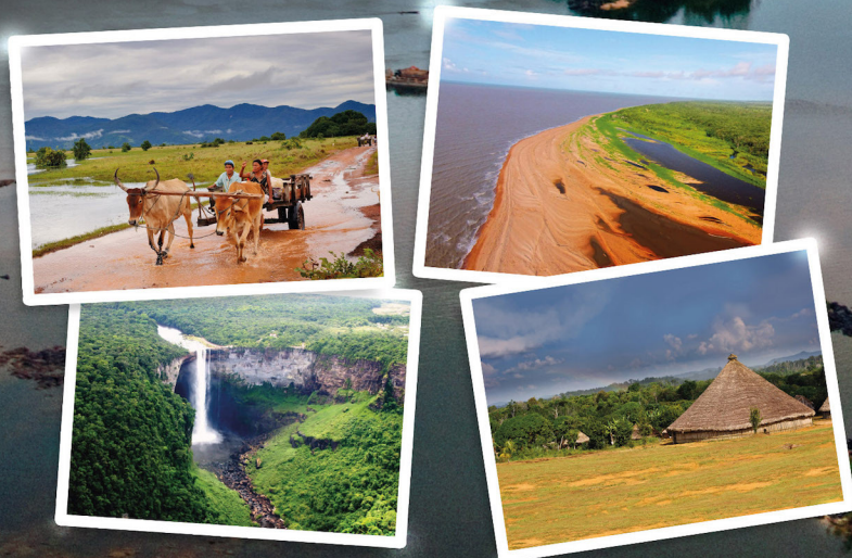
Left to Right: Kanuku Mountains Protected Area, Shell Beach Protected Area, Kaieteur National Park and Kanashen Amerindian Protected Area.

The Trust supports Guyana's commitment to establish an additional 2 million hectares of protected areas under the NPAS.